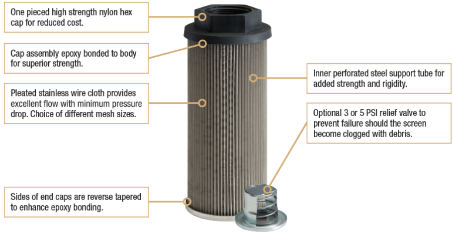
Suction (SUMP) Strainer

Ohio Fabricators Co. has been making strainers, breathers, and suction screens for over 75 years, and all of them are made here in the USA. Give us a call to see how we can help you.